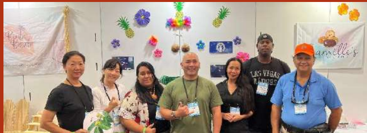
CNMI STEP CLIENTS AT THE AUGUST 2022 AFFORDABLE SHOPPING DESTINATION (ASD) TRADE-SHOW IN THE LAS VEGAS CONVENTION CENTER